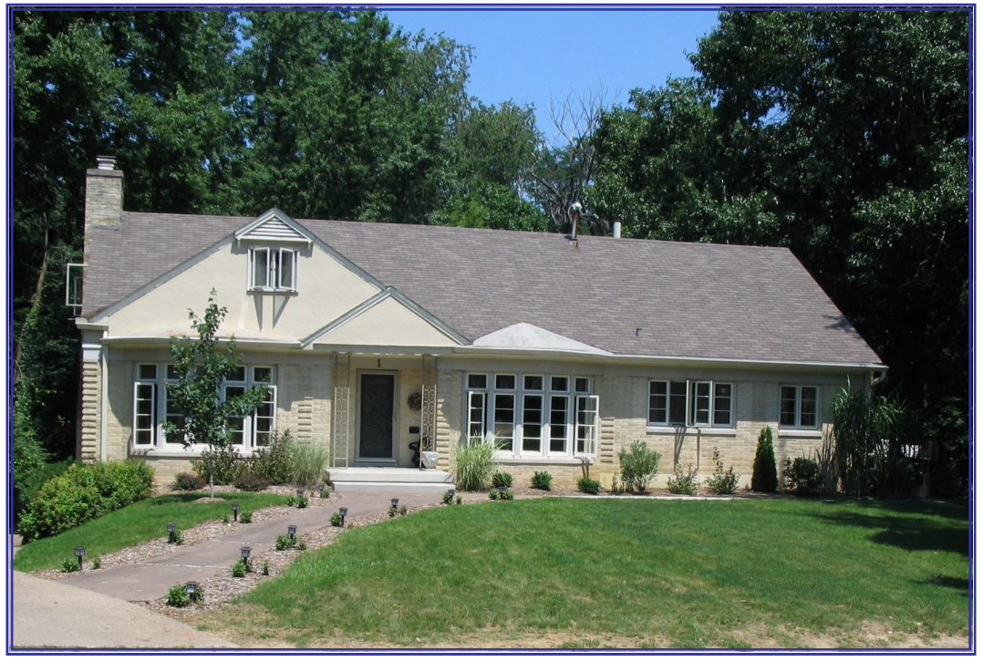
At this point cross the street and return east along the south side of Watch Hill Road. Note that further to the west, the homes have 40th Avenue addresses. They are not part of the Watch Hill Subdivision but lie in a 1918 subdivision

Ralph and Lela Ritter, who were associated with Ritter Real Estate. were the first owners of this home built in 1951 at a cost of $32,000. Stucco gables topping the brick walls provide visual variety in this Minimal Traditional style house. While obviously a modern home, the effort to incorporate the traditional influence is apparent. The roof is simple, composed of intersecting gables and false gables. A classic column or modern quoin effect is seen at either side of the bay windows. It was created by stacking especially long bricks, alternately recessing and extending the courses. Casement-style windows, topped with transoms, accent these slightly protruding bays. Simpler casements appear elsewhere in the home. In the 1960s, the home was enlarged with a three bedroom addition.