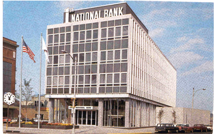
Vintage 1960s Postcard. Read more about the 1 st National Bank at RIPS Postcards From Home. www.rockislandpreservation.org/postcards-from-home/first-national-bank/

Last year, RIPS decided to become more proactive in making Rock Island Landmark applications, using the Preservation Commission's "Most Significant Unprotected Structures" (MoSUS) list as a starting point. The original First National Bank building, later the Modern Woodmen Bank, was selected as a good candidate last summer because it had been largely vacant. That was a fortuitous choice as on August 27, a story appeared in the Dispatch/Argus that MWA was going to demolish the bank citing non-cost effective needed upgrades. RIPS submitted the application last month, basing the nomination on the premise that the building meets four criteria of the Preservation Ordinance. Only one criterion needs to be met. Those criteria are: