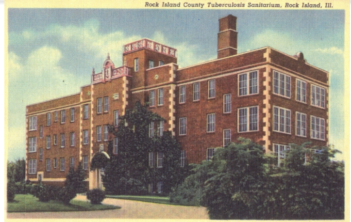
Rock Island County Tuberculosis Sanitarium, Rock Island, Ill.

The plague of tuberculosis, usually called TB, is all but forgotten, thanks to modern antibiotics. In the late 1800s, tuberculosis, also called consumption, the white plague (in contrast to the black plague), and phthisis, among other things, was the leading cause of death for those between the ages of 15 and 45. While TB can affect many organs, most commonly it is pulmonary tuberculosis, a lung infection. A diagnosis was a death sentence, sometimes within years, occasionally in decades. Until the disease was critical, symptoms were often mild. In addition to general debility, consumption's most obvious symptoms were coughing and hemorrhaging. The disease was so much a part of daily life, that it was prominently featured in Puccini's La Boheme , whose heroine Mimi ultimately died of lung hemorrhage.