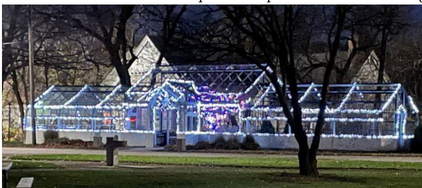
The simple but dramatic holiday lighting celebrated the historic Conservatory in Winter 2023

Join FOLV, dues are only $10 a year – see www.FriendsofLongviewPark.org Be sure to follow their Facebook page FaceBook.com/FriendsofLongviewPark1 And volunteers are always needed. Contact FOLV through their web page and learn how you can contribute. Come to a monthly meeting – they're held on the first Wednesday of each month at 6:30pm.