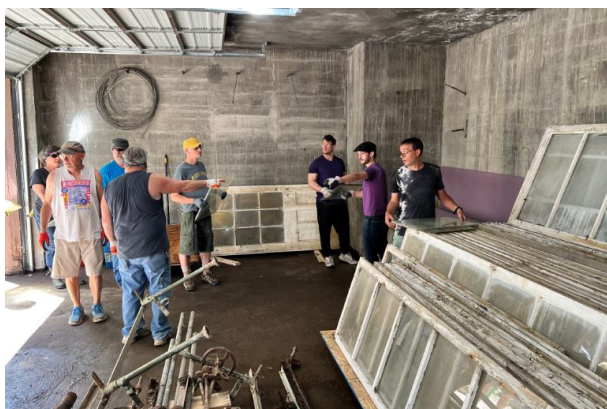
Volunteers store salvaged conservatory panels

(Continued from front page) The worn out tennis courts have been removed and will be replaced with a natural garden. There are so many amenities in Longview, most of which the average citizen is unaware. That is unless we're interested in that particular thing. Fortunately, the park is big enough to accommodate everyone's interests.