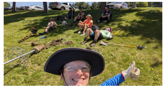
Disc Golf volunteers work on the course

So fundraising had to begin. From small donations to larger grants, the treasury began to grow. Additional grant applications are pending. A generous program offered by Royal Neighbors to members brought in additional funds. And volunteers grew exponentially. Gardeners especially began to “adopt” areas of Longview. There are new banana trees by the Helen Horst former pool area. The volunteer who supplied them will dig them up this fall to be replanted in the spring. A paranormal group, Whispering Souls, recently led an exploration of the park with all proceeds donated to FOLV. And Quad Cities Disc Golf took on the task of improving the course at Longview.