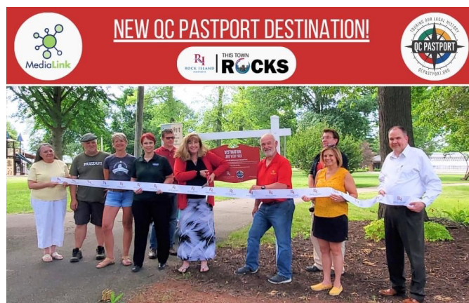
Ribbon cutting for QC Pastport destination at Longview Park