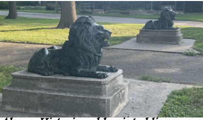
Above, Historic gold painted lions greet visitors at 18th Ave entrance to Longview Park. Below, donated bronze lions replace the deteriorated gold painted lions

A decade prior to that anniversary, in 1997, a new 501c nonprofit corporation, Friends of Long View (FOLV), was formed to enable donations to the park and encourage more citizen participation in planning its future. FOLV brought back a beloved historical event, the lantern parade, in those first years. Other goals were commendable – notably restore the lower lagoon – but most were not achieved. After 2008, it seemed that interest in FOLV declined. Rather than dissolve the corporation – it's a lot of work to achieve 501c status – on the advice of legal counsel, the organization went inactive. This meant that an interim board was established, primarily to keep up to date with IRS and Illinois Secretary of State filings.