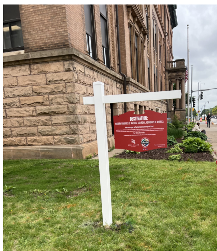
Downtown Rock Island Public Library displays its Pastport signage

Here is a list of the sign locations in Rock Island. You can pick up a brochure with a map listing all Quad City locations at our next RIPS meeting at Hauberg.